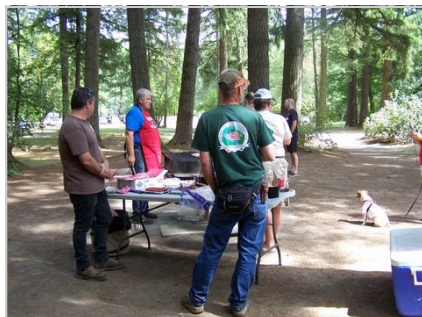
Hey guys! Look over here!