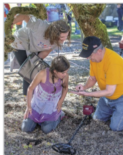
Treasure is found

We even made the front page of the Longview Daily