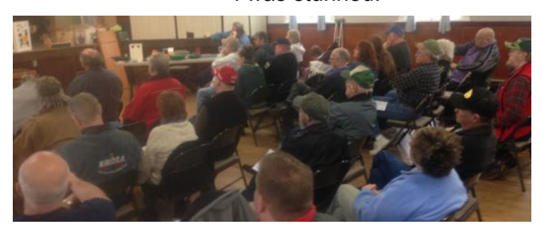
Members in rapt attention...

It was at the South West Washington Gold Prospectors Club meeting at the Minnehaha Grange hall alright, but it was not the type of presentation I was used too! I get told we are sound financially, which is a good thing. We have opportunities alongside the responsibilities to the club, and we will need to be ready to roar! I see the growth of our club and it's message of stewardship, cooperation and education as being the very type of organization I need to belong too. With an elected youth stewardship/advisor, and myself a past-life youth counselor, I get a great deal of honor being associated with the next organization to lead our troubled families into the natural world of adventure, service, stewardship. I learned about a Briggs family discovery, which was fraught with all the normal kinds of human nature events we all stumble through, and literally stumbled upon. Pocket Gold sounds sexy, like rocket gold or some-such... but the take-away was: pay attention to where you are, what you are standing on, and always be 'deserving and ready for the riches of the universe to land upon you'.