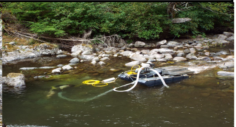
D&K Prospecting and Detector Sales dredge SWWGP Club members operating a high banker, dredge and sluice box on Copper Creek