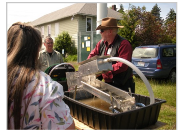
How To Demos 2012