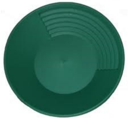
A favorite, one size fits all

This should be all that is required to break in/season your new gold pan!