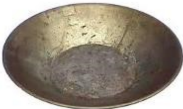
Old style metal gold pan,(note, no riffles)

-Keep your fingers out of the gold pan as much as possible(the piece of gold in the video was made to float by wiping my index finger across my forehead and quickly submerging it in the water)