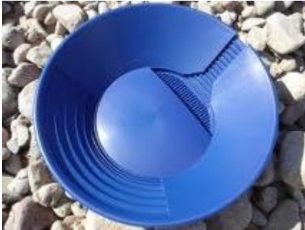
Modern gold pan with various riffles and gold traps

Modern plastic gold pans with sharp molded riffles are a vast improvement over traditional smooth metal pans. Some die hard panners prefer to use the metal pans however newly designed plastic pans are lighter and help the novice panner retain more gold and speed up the panning process.