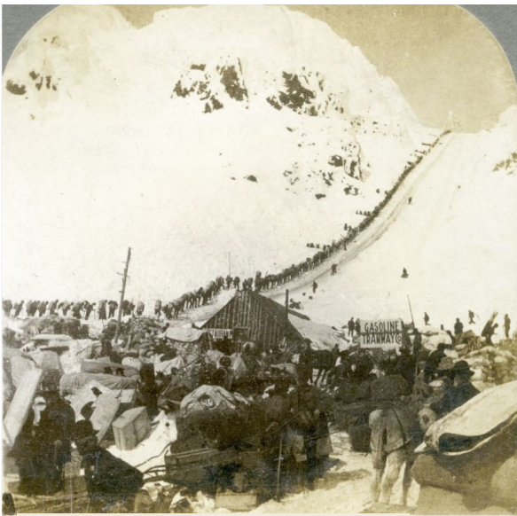
Bound for the Klondike Gold Fields Chilkoot Pass Alaska