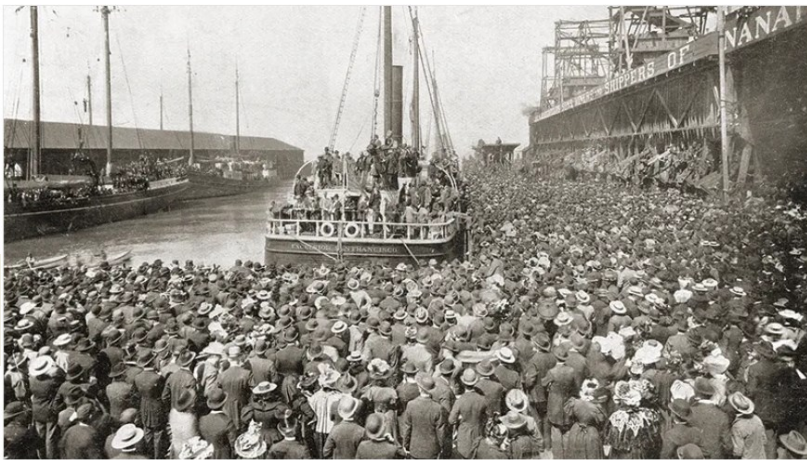
The S/S Excelsior leaves San Francisco on July 28, 1897, for the Klondike.

The SS Excelsior Leaves San Francisco on July 28, 1897 for the Klondike