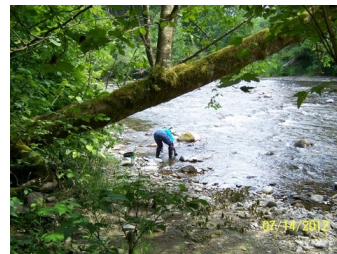
Lewisville Park Fun 2012