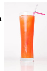
Sex on the beach

Now that I'm back home, I realize that even here a lot of homework must be done to find gold. I also realize that it is less expensive to travel to areas near home. And bribery isn't a major part of the law system here either. There are even beaches to mine here, sex or no on the beach! But, dreams are nice, aren't they?